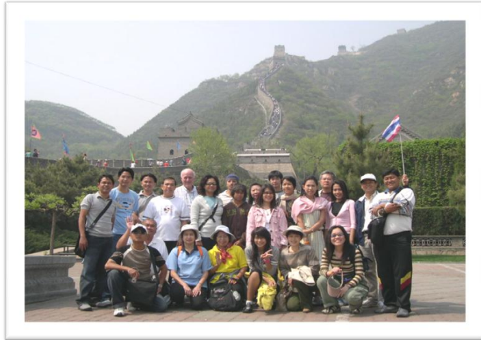
BEIJING – April 2007 你好