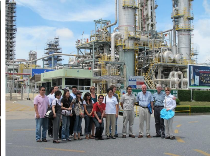
Field Trip to Map Ta Phut 10 September 2010